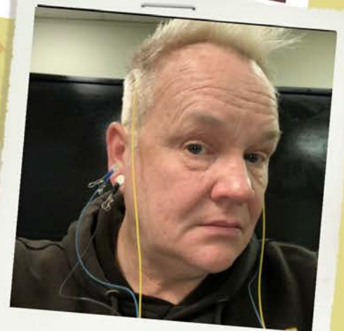
BRAIN TRAINING NEUROPTIMAL