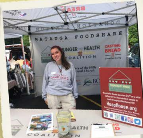
WATAUGA FOODSHARE DONATION STATION