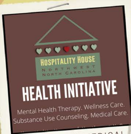
BEHAVIORAL & MEDICAL HEALTH INITIATIVE