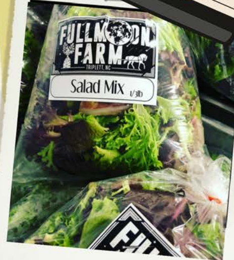
SUPPORTING LOCAL FARMERS