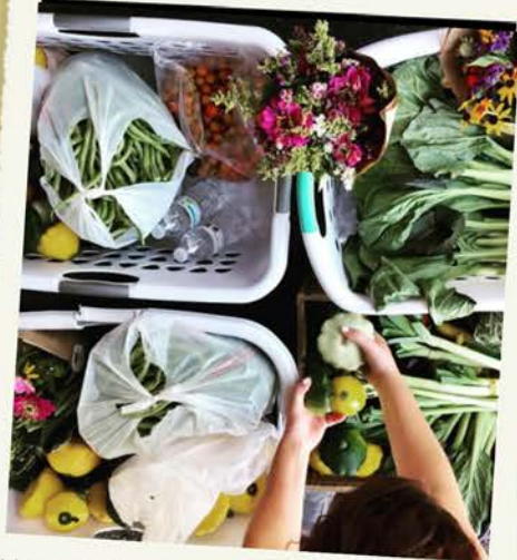
WATAUGA COUNTY FARMERS MARKET