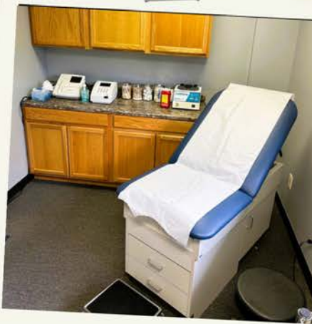
VOLUNTEER MEDICAL PROVIDER